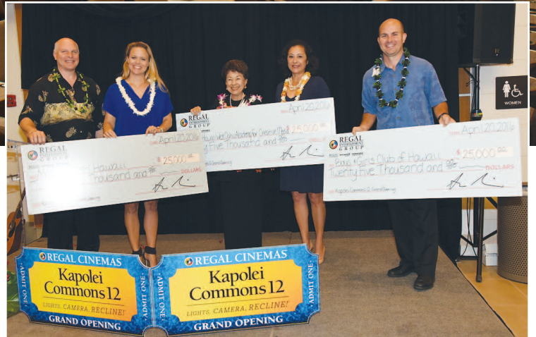
Checks for $25,000 each were presented to Make-a-Wish Hawaii, Boys and Girls Club of Hawaii and University of Hawai'i West O'ahu Academy of Creative Media as a result of the Grand Opening Preview event at Regal Kapolei Commons 12.