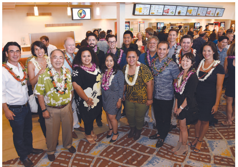
The MacNaughton Group, The Kobayashi Group and Craig Realty, developers of Kapolei Commons, celebrated the opening of Regal Kapolei Commons 12 with representatives from the University of Hawai'i West O'ahu Academy of Creative Media.